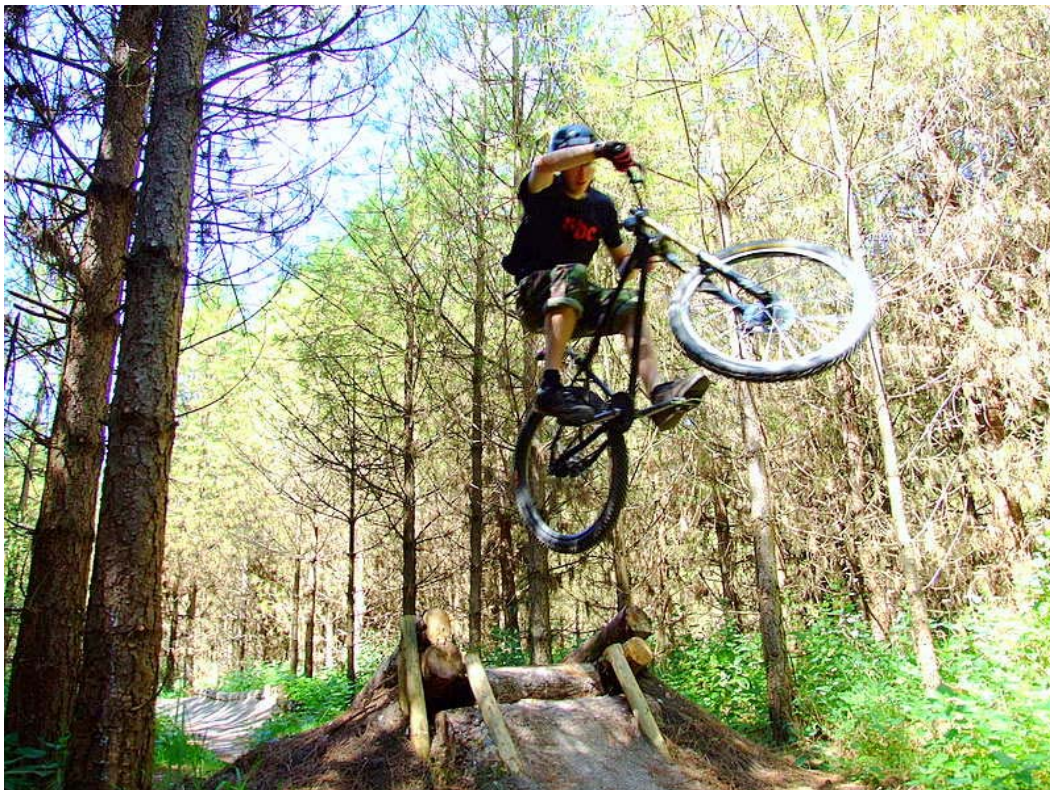
Phillip Goodrum demonstrating the correct way to ride the new Tightrope section

Next trail building day Saturday 2 nd February, 9:30am in the Gorilla car park, High Lodge